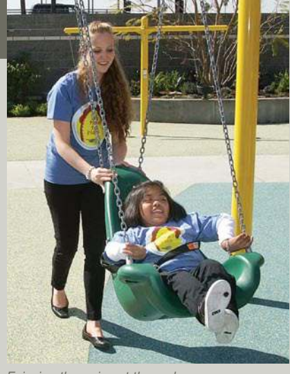
Enjoying the swing at the park