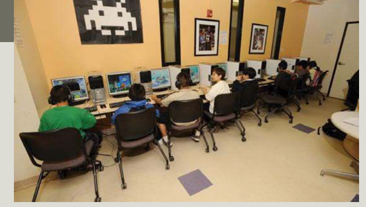
Students at work in a computer lab at HOLA