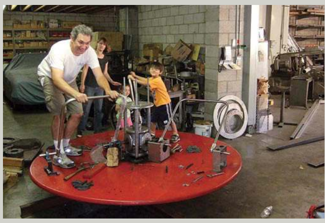
Assembling the special merry-go-round for the park