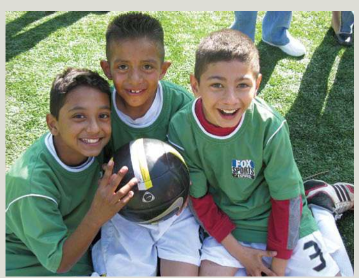
Sports activities are an integral part of HOLA's programs