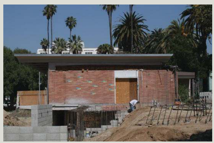
Construction underway on HOLA's Lafayette Community Life Center

With its unique partnership with the L.A. City Recreation and Parks Department, HOLA offers children and youth in one of the most densely populated areas in the Los Angeles area access to much needed green space, including a turf soccer field, outdoor basketball courts, and a new gym.