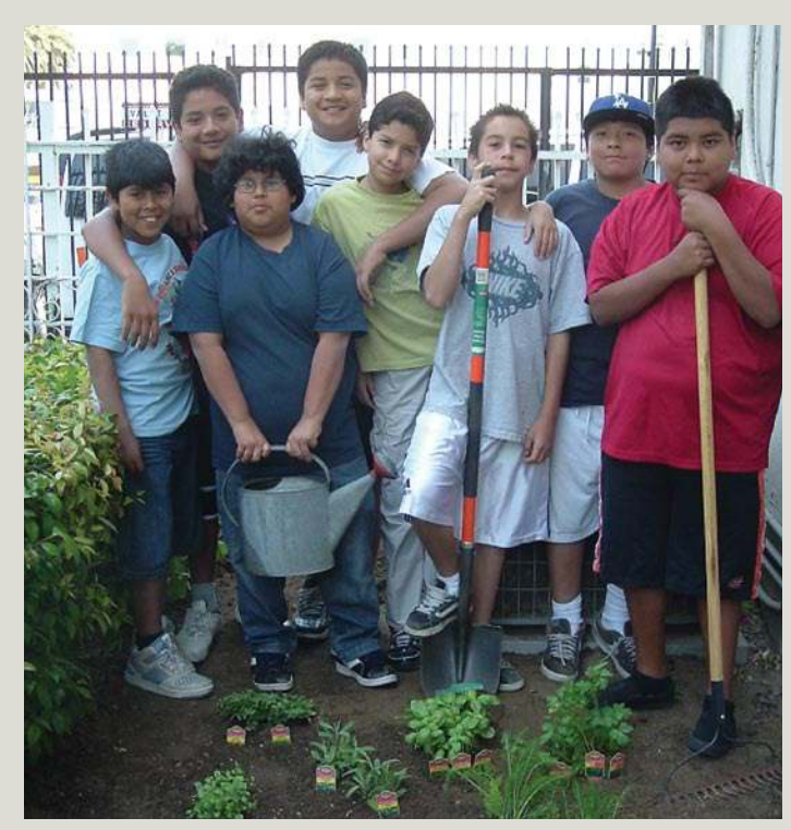
HOLA kids tend the community garden in Lafayette Park