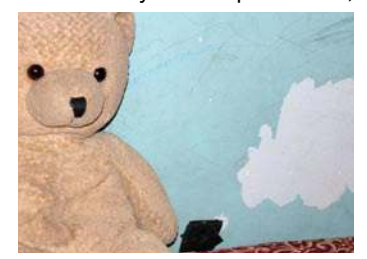
Children who eat lead-based-paint chips found in slum housing risk serious health problems including mental retardation